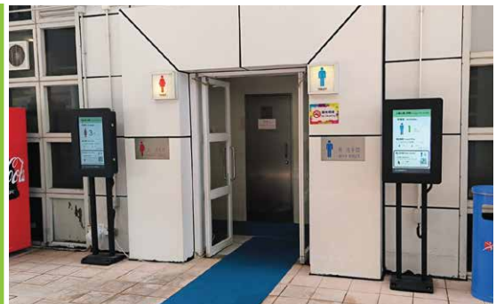
Smart toilet solution at public park