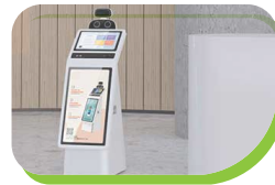
Customer Service Robot

Powered by advanced deep learning algorithms, our cleaning robot possesses the ability to identify various floor types and automatically adjust its operation mode accordingly.