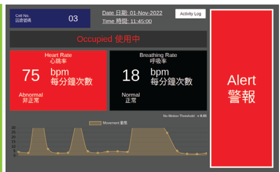
Vital sensor solutions for a department under the Hong Kong Government