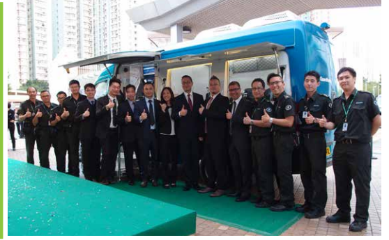
Built and operate Hong Kong's first mobile branch for a note-issuing bank