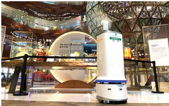
Disinfection robots for shopping mall