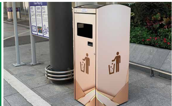
Smart bin at transportation infrastructure