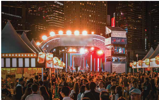
Official cash-in-transit and electronic security vendor for large-scale event

Security Personnel & Electronic Security