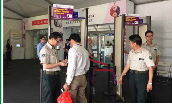
Official security personnel and electronic security provider for the first outdoor jewellery show in Hong Kong

Security Personnel & Electronic Security