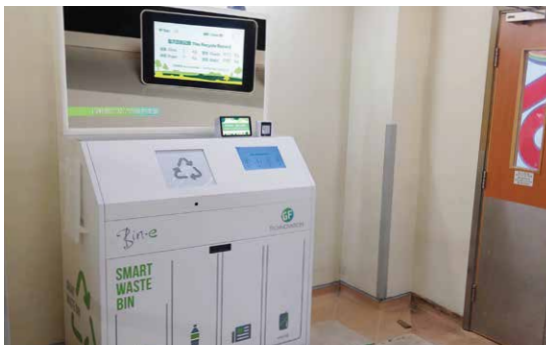
Auto-sorting recycling bin at hospital