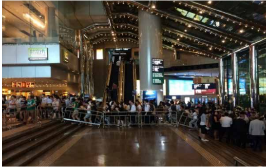
Official logistics provider for a note-issuing bank's 150 th anniversary commemorative note